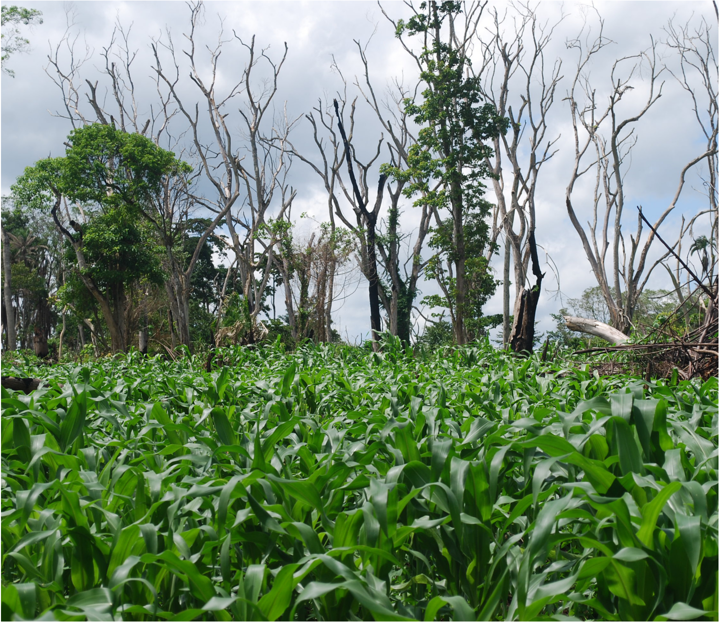
Forest land in Kagombe, Kibaale turned into farmland.