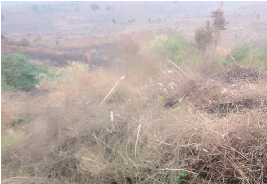
Part of destroyed forest waiting for planting in Nyairongo

The destruction of Bugoma Central Forest Reserve started when the Omukama (King) of Bunyoro Kitara leased out more than 5700 hectares of forest land to Hoima Sugar Limited.