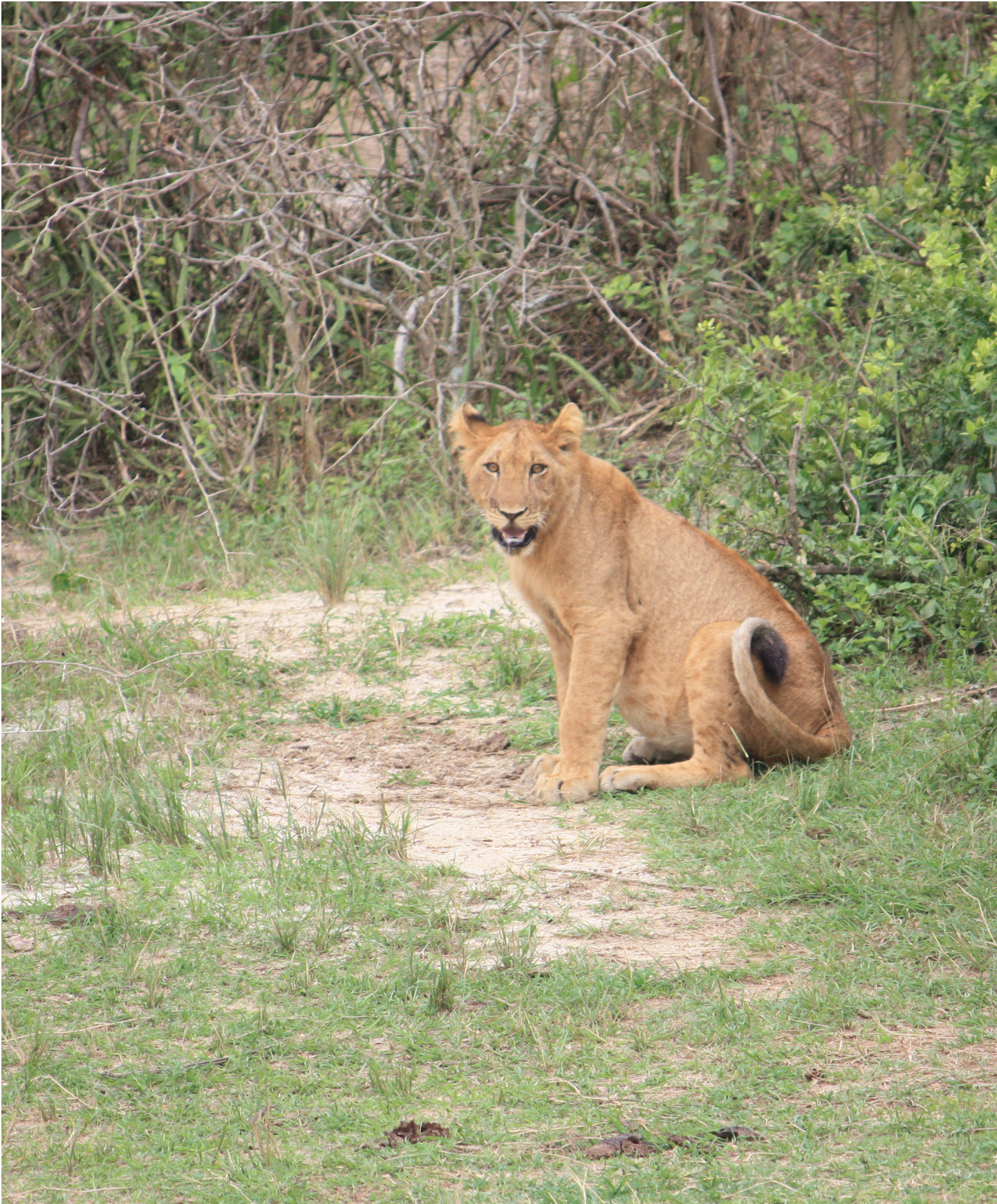
In our next edition we focus on wildlife trafficking and behind the scenes in the killing of lions.