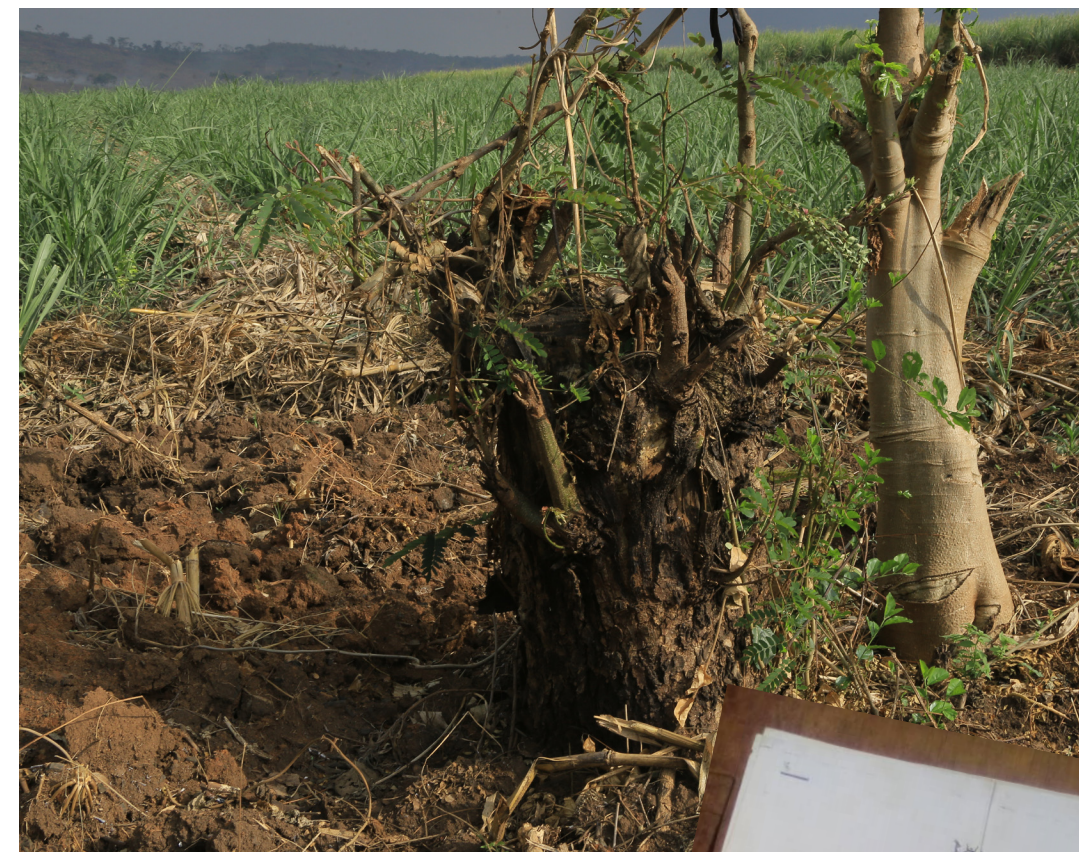
Land comprising part of Bugoma forest opened up for planting in Kikuube District.

agreed to only be allowed to harvest their crops and vacate the forest land but in vain.